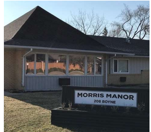
(12) The Morris Manor Limited - Upgrades & Improvements to the look and function of the Morris Manor.